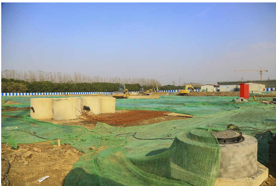
The site is marked out and the ground work is in full progress.